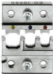
Die for crimping machine CF 500, for insulated cable lugs (C ... RCI... and C ... FCI...) 0.5 ... 6 mm 2

Please be informed that the data shown in this PDF Document is generated from our Online Catalog. Please find the complete data in the user's documentation. Our General Terms of Use for Downloads are valid ( http://phoenixcontact.com/download )